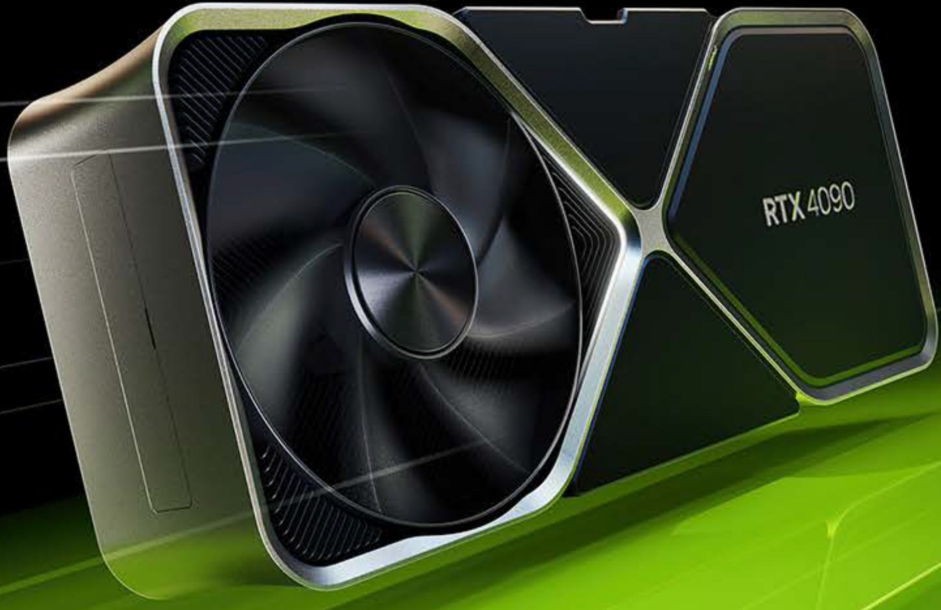
Up to 4x Performance

The NVIDIA® GeForce RTX™ 4090 is the ultimate GeForce GPU. It brings an enormous leap in performance, efficiency, and AI-powered graphics. It's powered by the NVIDIA Ada Lovelace architecture and comes with 24 GB of G6X memory to deliver the ultimate experience for gamers and creators.