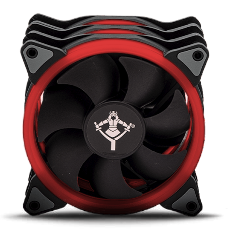
Fan speed & preasure Always keep your most important components cool with the powerful fans up to 1500 RPM ensuring that your system will always stay fresh