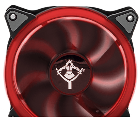
Air Flow It has an airflow of 36 CFM to keep your PC in the best condition, prolonging its useful life.