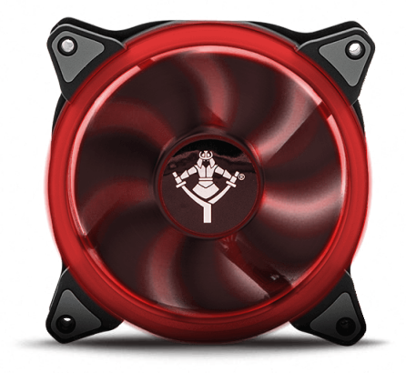
Fan Maintains a quiet environment even when loading thanks to its 23.5dB of maximum noise.